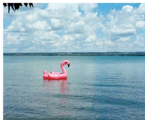
Dana Stirling - Floating in the River, Romulus, NY, 2020