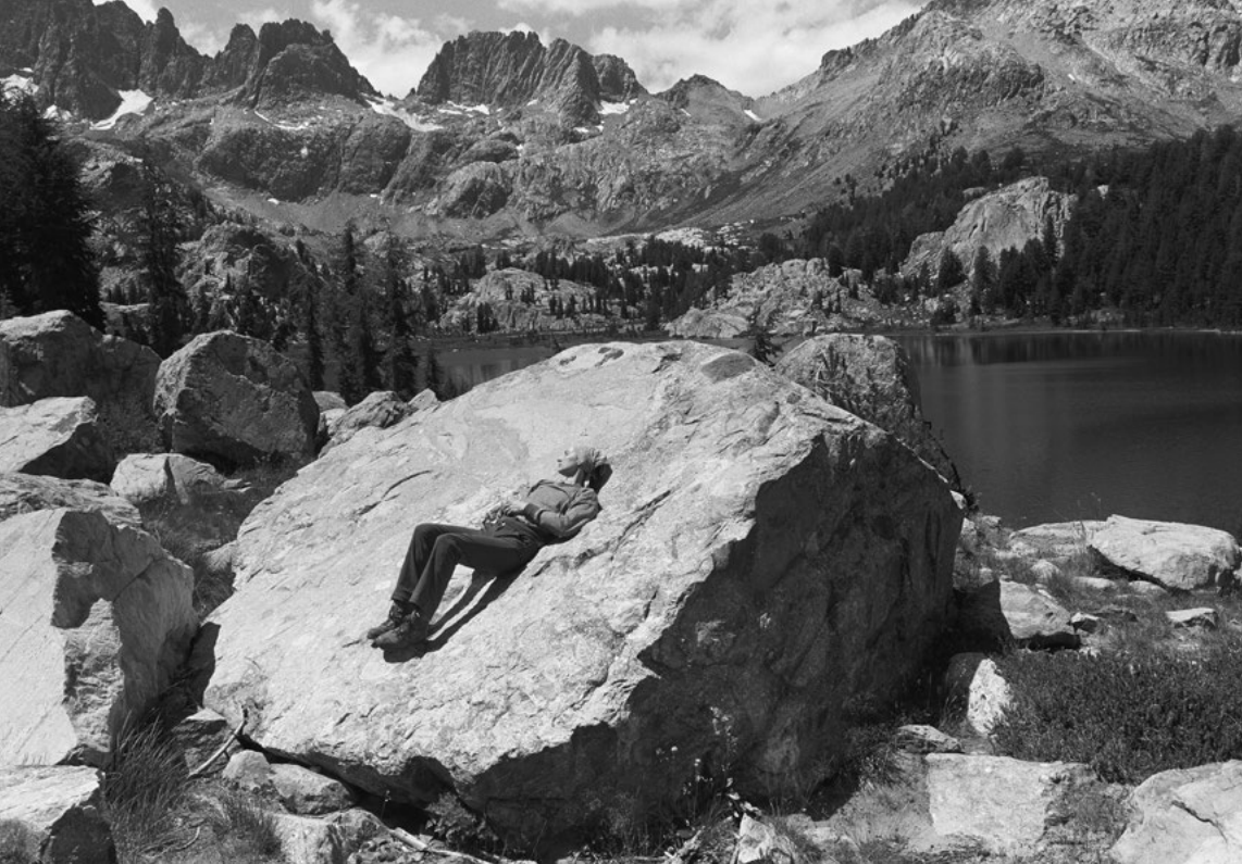
© Kelli Connell, Betsy, Lake Ediza , 2015