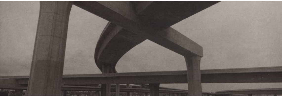
© Catherine Opie, Untitled #7 (Freeways) 1994, platinum print, 2 1/4 x 6 3/4 inches, 8 3/4 x 14 3/8 inches framed Courtesy of Regen Projects, Los Angeles; Lehmann Maupin, New York, Hong Kong, London, and Seoul; and Thomas Dane Gallery, London and Naples

Join us at the Museum of Contemporary Photography before the lecture for our Festival Meet and Greet. See the MoCP's current exhibition and catch up with friends before walking over to the lecture.