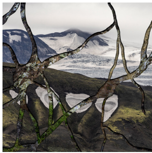
Charlotta Hauksdottir Imperception VI, 2021 Archival Inkjet Prints, Hand Cut & Layered with Mixed Media 11" x 11" 2/5 $800