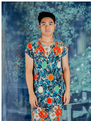
Khim Mata Hipol untitled (dress #6) Archival Inkjet Print 12" x 10" 1/6 $1,300