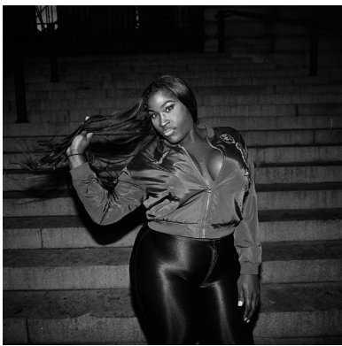
Luigino (Louie) Palu Nikki in Chinatown , 2018 Gelatin Silver Print 29" x 27" AP $2,200