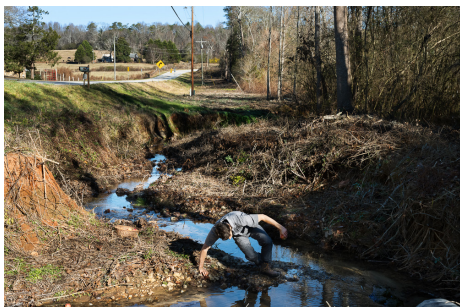
Forrest Simmons In Case of Hunger, 2023 Archival Inkjet Print 21" x 27" 1/6 $3,000