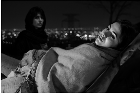
Sara Abbaspour To Float Archival Inkjet Print 27 1/2" x 36" 2/4 + 2 AP $2,000