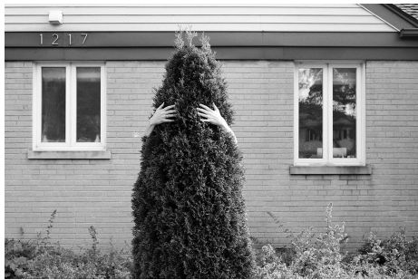
Kathryn Rodrigues What About My Dreams?, 2022 Archival Pigment Print 16" x 20" 1/10 + 2 AP $600