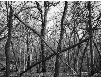
Tanya Lunina Nature Disorder, Study 5 , 2023 Archival Inkjet Print 18" x 25" 1/15 $650