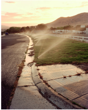
Brad Ziegler Winnemucca, From The False Parting, 2022 Archival Pigment Print 20" x 16" 1/10 $600