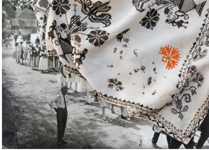
Astrid Reischwitz Filling the Blank , 2019 Archival Pigment Print 23" x 28" 2/3 (3 AP) $2,775