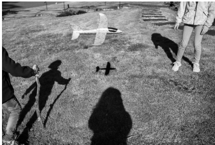
Denise Laurinaitis In Flight, 2020 Archival Pigment Print 16" x 24" 1/10 + 2 AP $1,800 framed ($1,250 unframed)