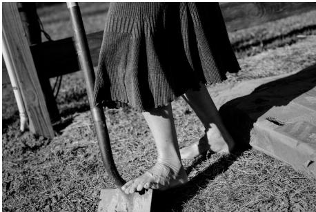
Archival Pigment Print 21" x 24 1/2" 1/10 $450, unframed

Childersburg has known a dark and complicated history that continues to the present day. The area was once home to an important Creek chiefdom called Coosa, where Spanish conquistador Hernando de Soto enslaved people in 1540. Four hundred years later, the Alabama Army Munitions plant located just up river from the town produced explosives such as TNT and secretly produced heavy water for the Manhattan Project. According to the EPA's 2017 Toxic Release Inventory, industries in the area release 1.5 million pounds of toxic chemicals into the Coosa River each year. As a response to national division and the COVID-19 outbreak, Sunshine and her husband Rusty bought a home in downtown Childersburg and created The Commons Community Workshop. Through their Fearless Communities Initiative they have built a community garden in a donated downtown lot, host trade days, and foster relationships with their neighbors as a means of "celebrating solidarity and strength." The couple invited me to find them on Facebook where Sunshine posts Initiative announcements, vocalizes her opposition to vaccines, and shares her beliefs about global child sex trafficking networks, the threat of Marxism, and the coming of the end times, 2020