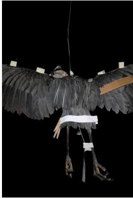
Constance Thalken Eyes Open Slowly #1 , 2013 Archival Pigment Print 45" x 30 ¾" $2,100