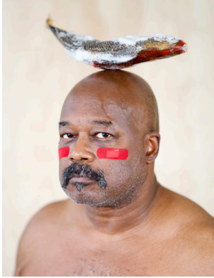
Mitchell Squire Undeclared , 2023 Archival Inkjet Print 24" x 36" $1,500