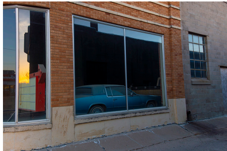
Laura Allen Noel Inside, 2023 Archival Pigment Print 18" x 24" 1/10 $600