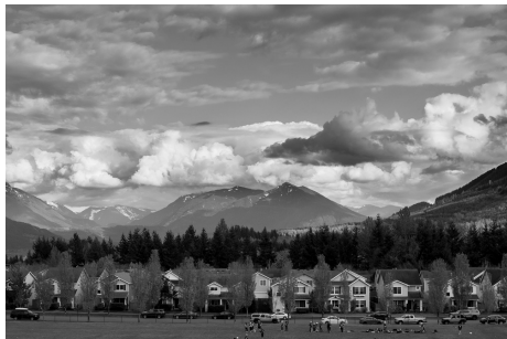
Jason Pevey Suburban Snoqualmie, 2019 Archival Inkjet Print 13" x 17" 1/10 $600