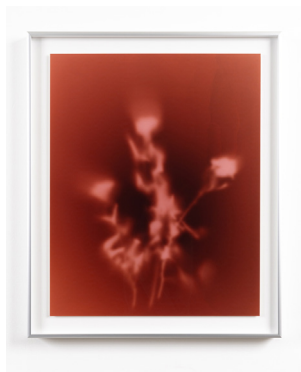
Peter Cochrane The Magician Longs to See: Climbing Rose (Red) Silver Halide Photogram 23" x 17" Unique $4,500