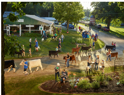
R. J. Kern Live Action Role Players, Blue Earth County Fair, Minnesota, 2022 Archival Pigment Print 26" x 34" 2/10 $3,000